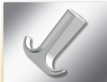
Roof Tube Support